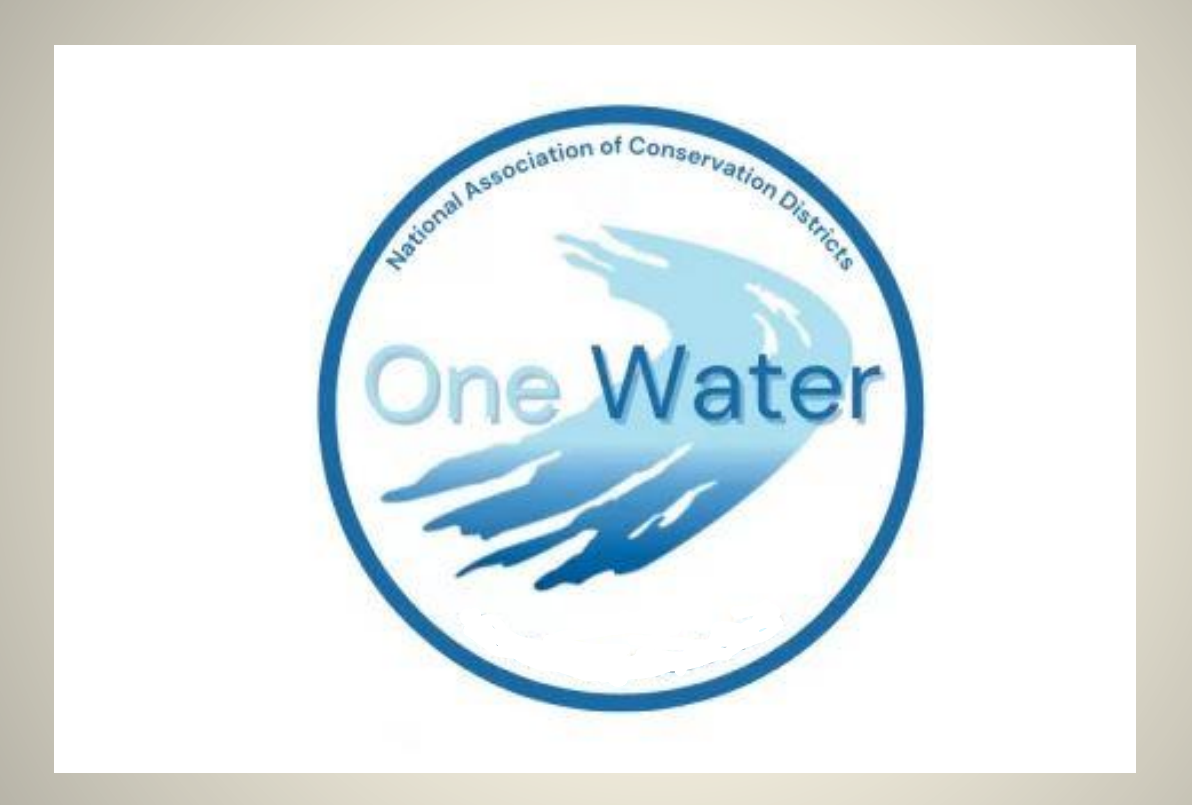
Sponsored by Farm Credit Association of Kansas